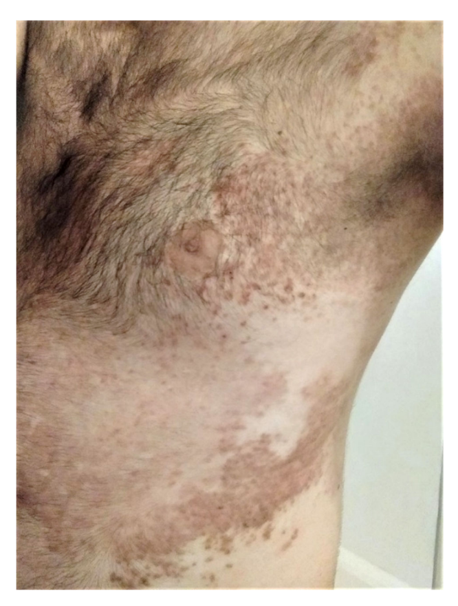
Fig. 8. Patient B. Rashes on the lateral surface of the trunk merge into plaques

Clinical manifestations, the results of histopathological examination convincingly confirm follicular dyskeratosis (Darier-White disease).