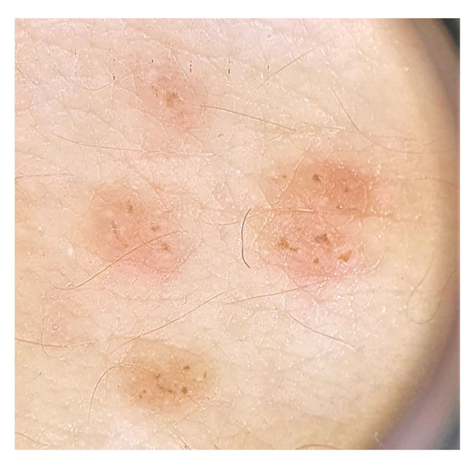
Fig. 4. Patient A. Trunk surface. Dermatoscopy. A picture of polygonal, yellow-orange-brown areas of different sizes, surrounded by a thin whitish halo and delimited by healthy skin

yellow-orange-brown lumps of various sizes, surrounded by a thin whitish halo and pink small-structured areas (Fig. 4-5).