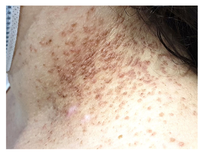
Fig. 2. Patient A. Dense domed papules of dark brown color on the lateral surface of the neck, merging into plaques

Similar papules are focally located on the upper limbs, abdomen and back. (Fig. 3) Small papules and exfoliation were noticed on the scalp. The mucous membranes of the oral cavity, nail plates, palms and soles were not affected.