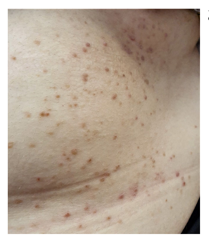
Fig. 3. Patient A. Papules on the anterior-lateral surface of the abdomen were located focally

Similar papules are focally located on the upper limbs, abdomen and back. (Fig. 3) Small papules and exfoliation were noticed on the scalp. The mucous membranes of the oral cavity, nail plates, palms and soles were not affected.