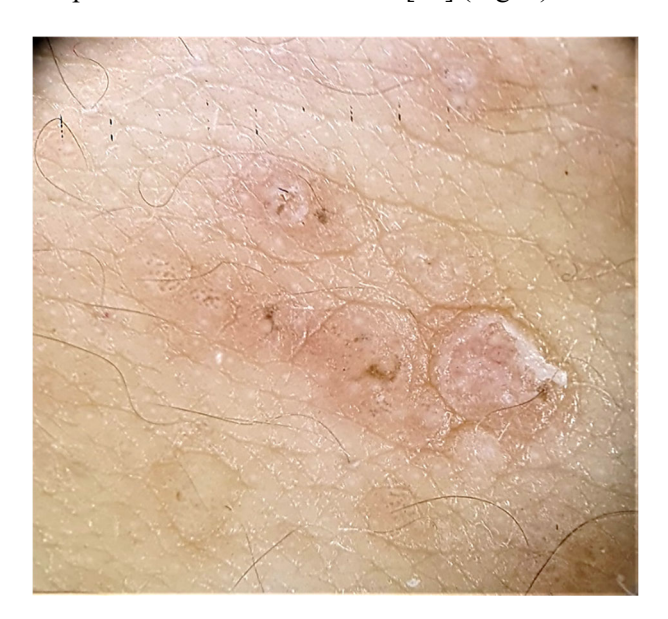
Fig. 1. Dermatoscopy of rash elements in Darier-White disease polygonal yellow-brownish areas with whitish halo

The dermatoscopy of skin lesions is characterized by the presence of several polygonal, branched, starshaped or rounded-oval yellow-orange-brown lumps of various sizes, surrounded by a thin whitish halo and pink small-structured areas. [10] (Fig. 1).