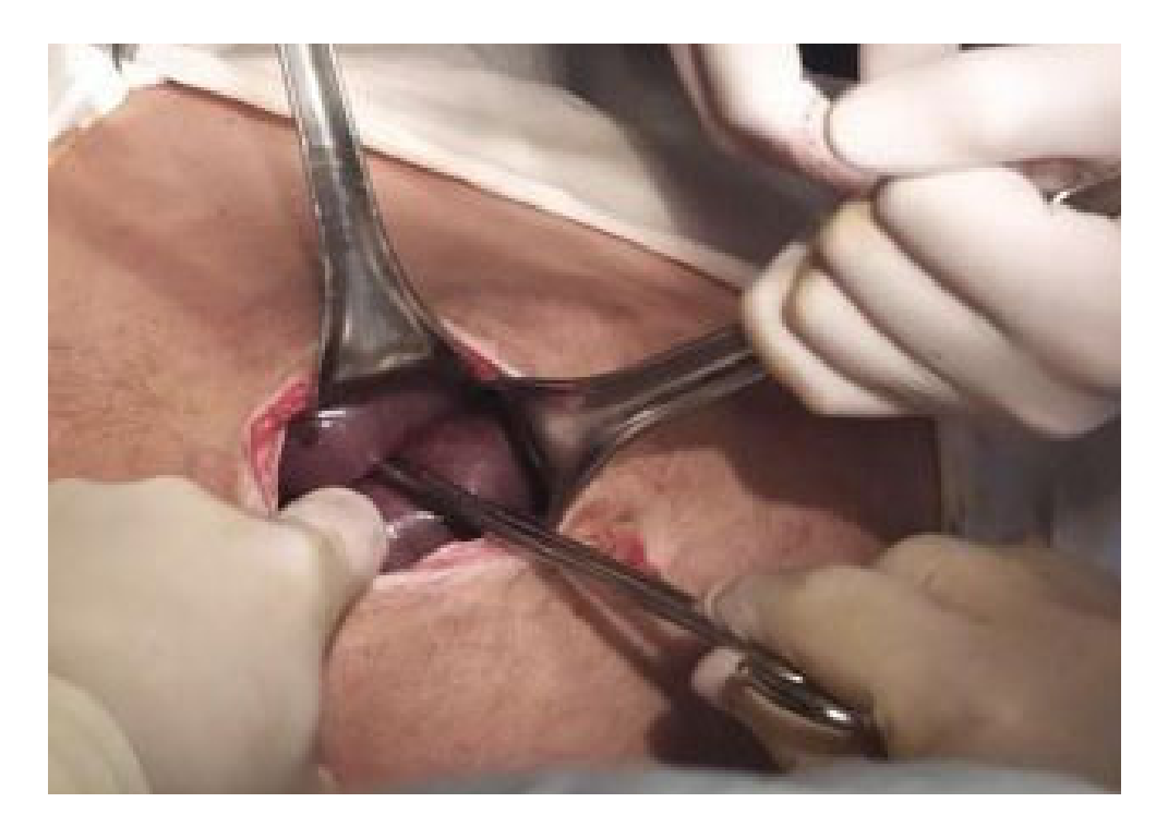
Fig. 2. Diagnostic mini-laparotomy in mesenteric thrombosis of the first segment of the superior mesenteric artery in patient M., 53 y.o. with COVID-19

At the stage of intestinal ischemia, vascular surgeries have been performed. At the infarction stage – vascular surgery in combination with intestinal resection or intestinal resection only.