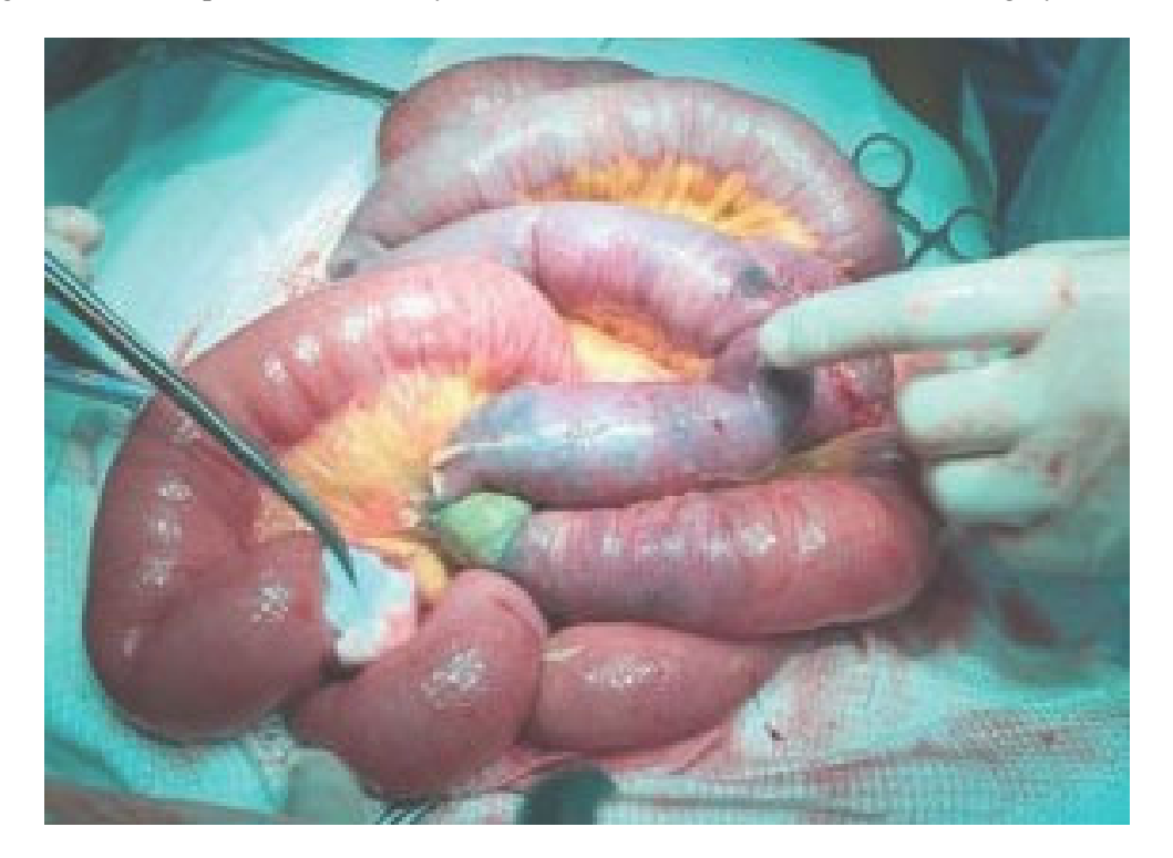
Fig. 3. Diagnostic laparotomy, patient M., 69 y.o.