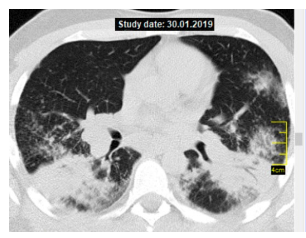
Figure 2 shows axial CT scans: on the left - on the day of diagnosis, on the right – after the end of MT therapy.

not require the correction of dose and administration schedule of MT.