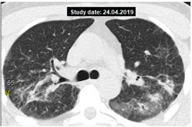
Fig. 1. Patient S., age 27, pulmonary sarcoidosis, stage II, atypical form - multiple massive consolidations in both lungs, respiratory failure (MRC 3); CT of TO (axial slice at the level of tracheal bifurcation): on the left - before treatment, on the right - regression after 3 months of treatment with MT (15 mg/week)

The tolerability of MT was satisfactory: there were no dyspeptic symptoms, at 7 months of the treatment period; moderate leukopenia and slight thrombocytopenia were found during the clinical blood test, while the value of these parameters did