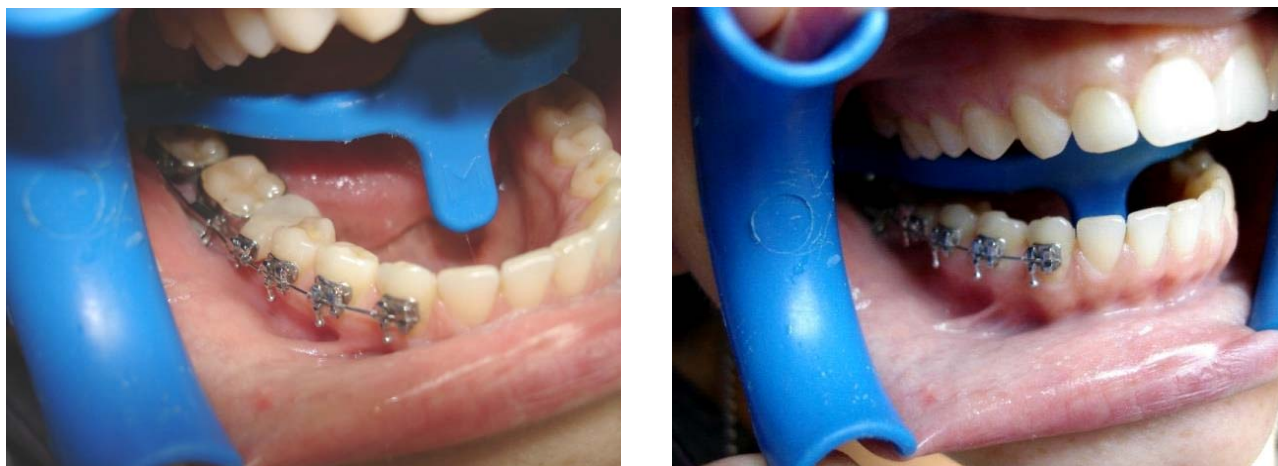
Fig. 2. Segmental bracket-system, temporary dental implant with plastic crown and brace in place of the extracted 46th tooth