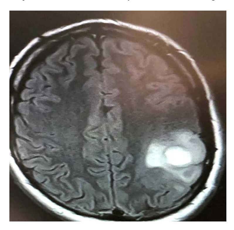
Fig. 1. MRI of a supratentorial primary tumor of the frontal localization on the left

In all patients, primary supratentorial intracerebral tumors of the frontal, temporal and parietal localization were diagnosed and verified by magnetic resonance or computer tomography (Fig. 1). The histological structure of the tumors was verified by examination of the surgical material.