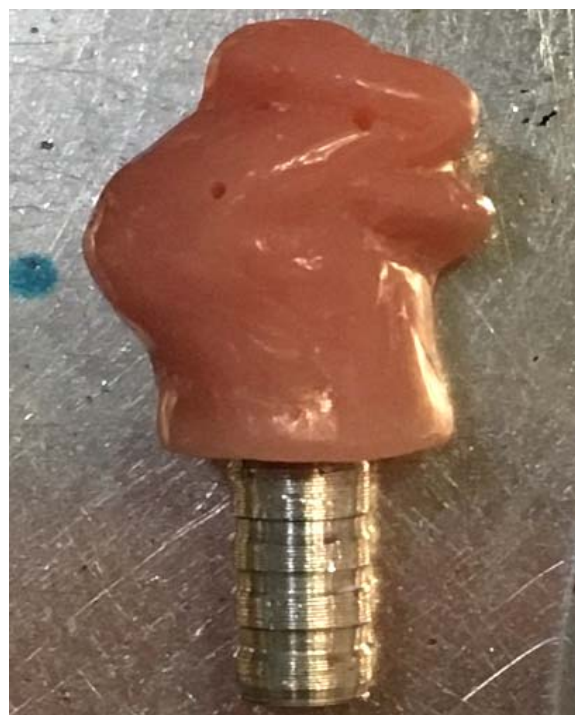
Fig. 2. Individual Drainage

Japan, 2017), which is a graphical interface to RFSC (The R Foundation for Statistical Computing, Vienna, Austria)