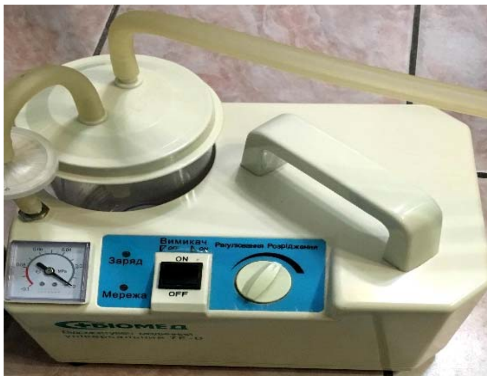
Fig. 3. Negative pressure device